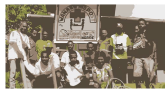
Integrated Nature Conservation and Public Health Programmes Combining ecosystem conservation and health provision services