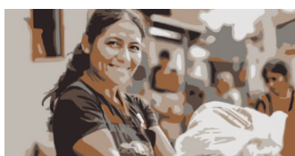
Social Protection Measures Combatting poverty and strengthening resilience of vulnerable populations