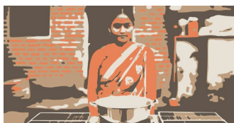
Clean Cookstove Programmes Reducing exposure to indoor pollution with energy efficient cookstoves