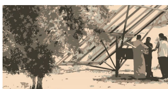
Decentralised Solar Energy Systems Generating cost-effective off-grid electricity at small scale