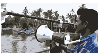
People-centred Early Warning Systems Alerting specific communities to extreme weather events