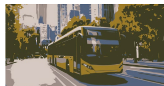
Decarbonising Urban Transport Expanding low- and zero emissions transport infrastructure