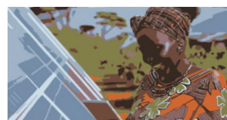
Green Energy Businesses for Women Supporting women to prosper in the green energy sector